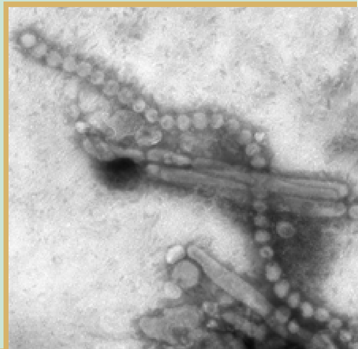
An Electron Micrograph Image of H7N9 Virus

The H7N9 virus could therefore change and become able to easily and sustainably spread between people, triggering a pandemic.